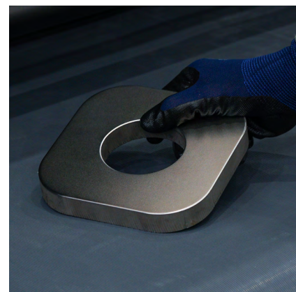
__ after DM1100 2C EVO: high performance on all edges and also on internal holes