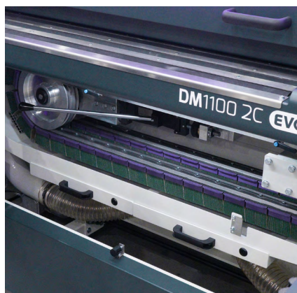
__ easy and tool free cross belt replacement