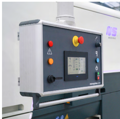
__ possibility of regulating which stations will work and at what speed, the working pressure for both stations, floating drum on/off and drum oscillation