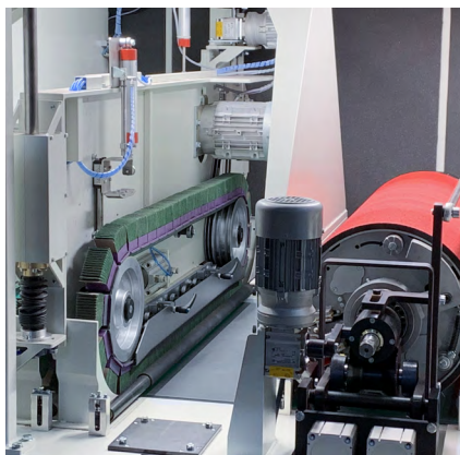
__ heavy burrs deburring and edge rounding