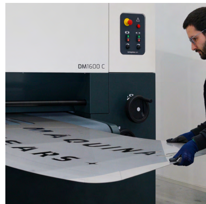
__ optimized for large workpieces up to 1600mm wide