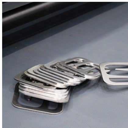
__ Greater productivity on small parts